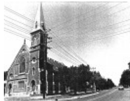
Former Golden Square Precinct 10 - Panton Street Church.jpg