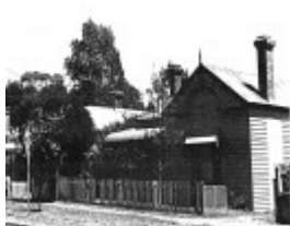
Former Golden Square Precinct 10 - House at 28 Panton Street.jpg