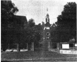
Garvel Hill School, the focal point of the precinct