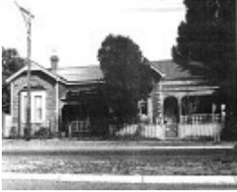
166-168 Mitchell Street, individually significant but not typical of the area as a whole which is generally of detached timber housing.