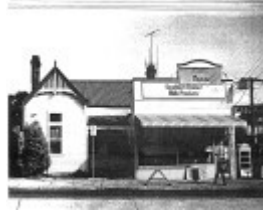
148 Mitchell Street: an altered but long term corner shop and residence which would have provided a focus for pre-car living in the precinct