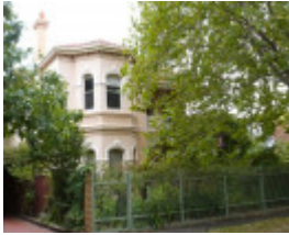
5 SORRETT AVE