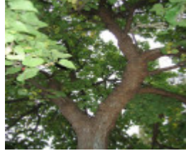
T12152 Morus nigra