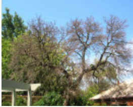
T12152 Morus nigra