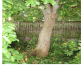
T12152 Morus nigra