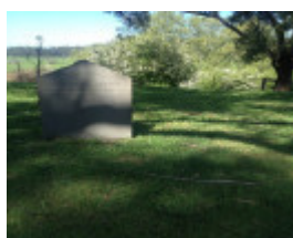
Coranderrk Cemetery. Site Visit - M.Miller 4/10/13