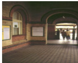
brighton beach railway station interior tiled floor