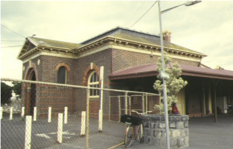
brighton beach railway station side view