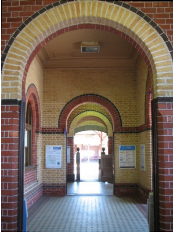
BRIGHTON BEACH RAILWAY STATION SOHE 2008