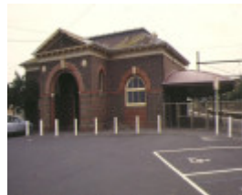
brighton beach railway station front entrance jan1995