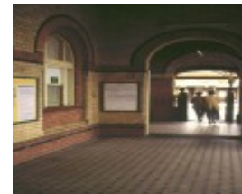
brighton beach railway station interior tiled floor