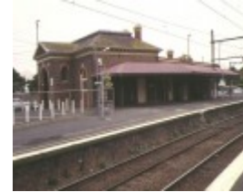
1 brighton beach railway station platform jan1995