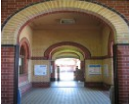
BRIGHTON BEACH RAILWAY STATION SOHE 2008