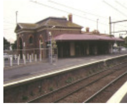
1 brighton beach railway station platform jan1995