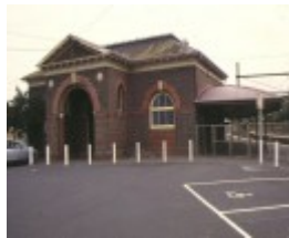
brighton beach railway station front entrance jan1995