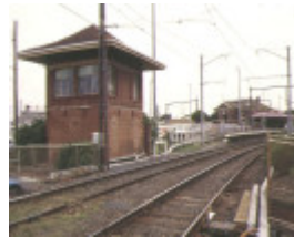
brighton beach railway station signal box