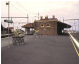
brighton beach railway station central platform jan1995