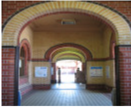
BRIGHTON BEACH RAILWAY STATION SOHE 2008