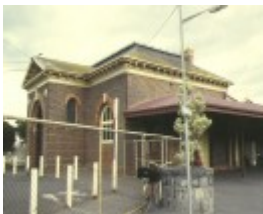
brighton beach railway station side view