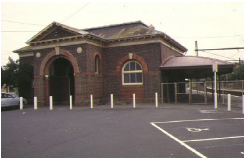
brighton beach railway station front entrance jan1995