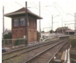
brighton beach railway station signal box