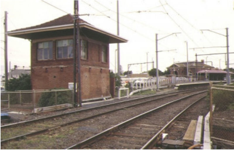
brighton beach railway station signal box