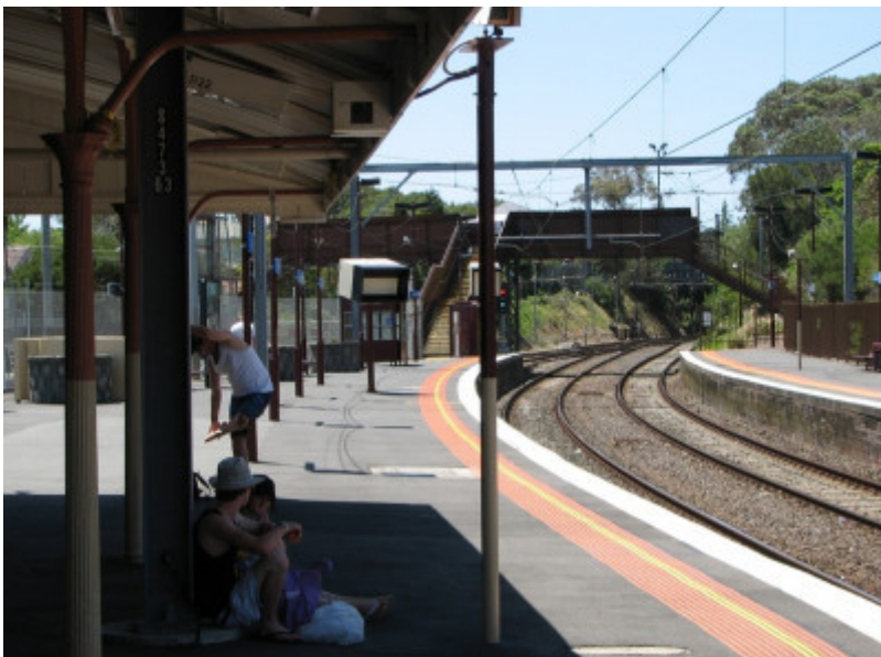
BRIGHTON BEACH RAILWAY STATION SOHE 2008