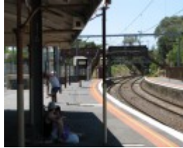
BRIGHTON BEACH RAILWAY STATION SOHE 2008