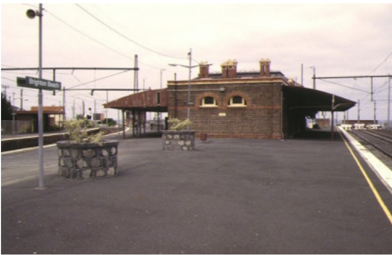
brighton beach railway station central platform jan1995