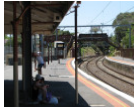
BRIGHTON BEACH RAILWAY STATION SOHE 2008