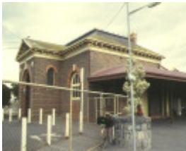
brighton beach railway station side view