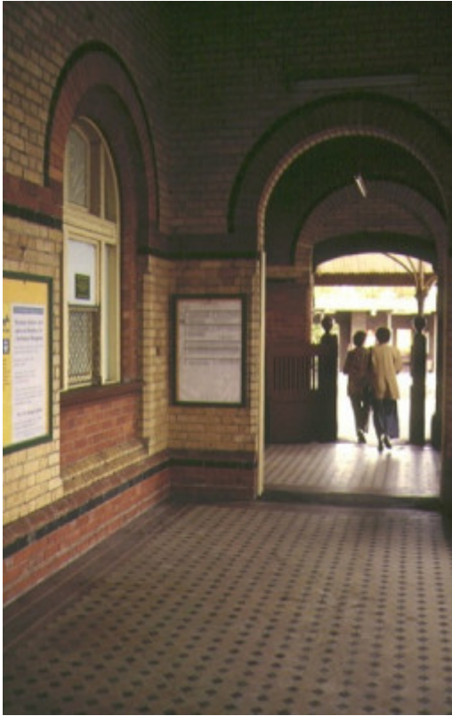
brighton beach railway station interior tiled floor