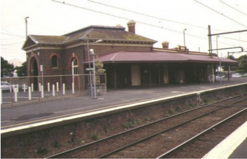
1 brighton beach railway station platform jan1995