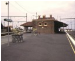
brighton beach railway station central platform jan1995