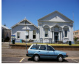
H543 orderly room gun room