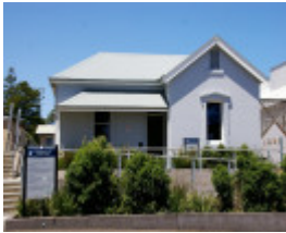
H543 orderly room residence