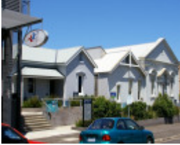
H543 orderly room residence kepler st1