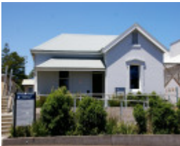
H543 orderly room residence