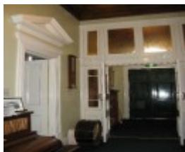
Mechanics Institute_Hamilton_hallway_KJ_April 09