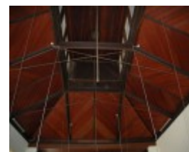
Mechanics institute Hamilton billiardsroof