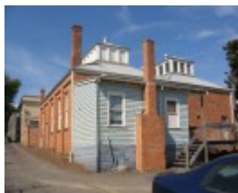
Mechanics Institute_Hamilton_rear view with 1903 additions_KJ_April 09