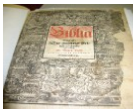
Mechanics Institute_Hamilton_C16 German bible_KJ_April 09