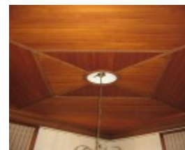
Mechanics Institute_Hamilton_timber ceiling in front room_AC_2007