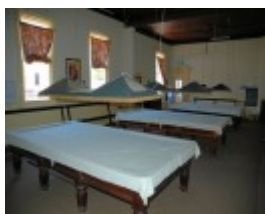
Mechanics Institute_Hamilton_billiard room_2007