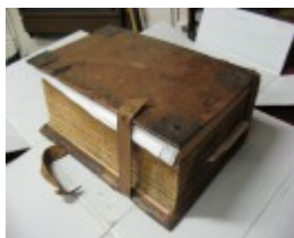
Mechanics Institute_Hamilton_C16 German bible_KJ_April 09