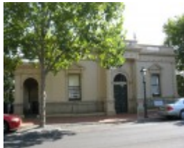
Mechanics Institute Hamilton_KJ_April 09