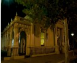
Mechanics Institute _JDM1026.jpg