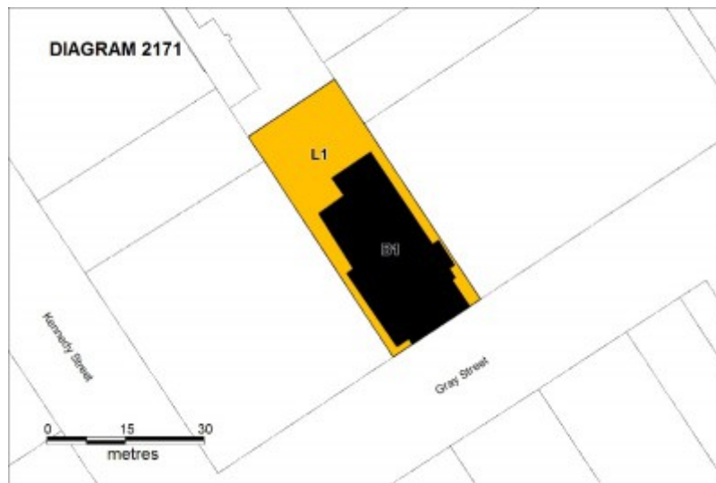
PROV 2171 hamilton mechanics institute plan