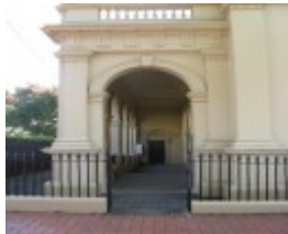
Mechanics Institute_Hamilton_arcade_KJ_April 09