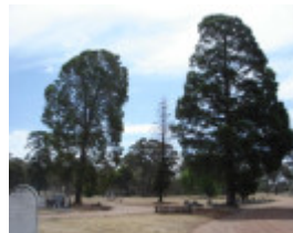
H2136 White Hills Cemetery 9 Feb 200 mz 041