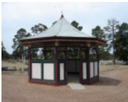
H2136 White Hills Cemetery 9 Feb 200 mz 048