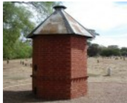
H2136 White Hills Cemetery 9 Feb 200 mz 022