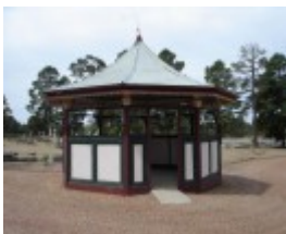
H2136 White Hills Cemetery 9 Feb 200 mz 048