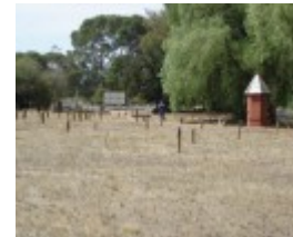
H2136 White Hills Cemetery 9 Feb 200 mz 025