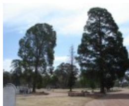
H2136 White Hills Cemetery 9 Feb 200 mz 041