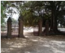
H2136 White Hills Cemetery 9 Feb 200 mz 001