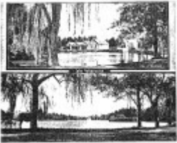
Lake Weeroona as in Bendigo For Sunshine Business and Pleasure (BCL) showing the picturesque timber structures which were once numerous.jpg