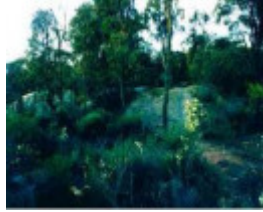
King of Prussia Mine