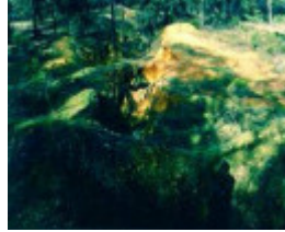
Black Forest Mine