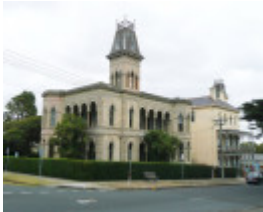
LATHAMSTOWE SOHE 2008