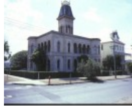
LATHAMSTOWE SOHE 2008 1 lathamstowe gellibrand street queenscliff front view