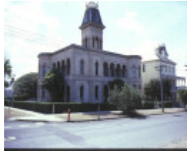
1 lathamstowe gellibrand street queenscliff front view