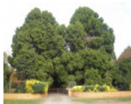
T12156 Cupressus torulosa