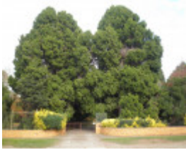
T12156 Cupressus torulosa