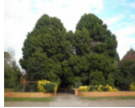
T12156 Cupressus torulosa