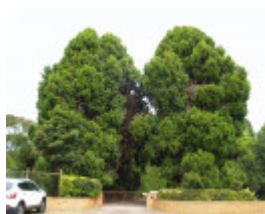
T12156 Cupressus torulosa