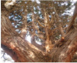
T12156 Cupressus torulosa