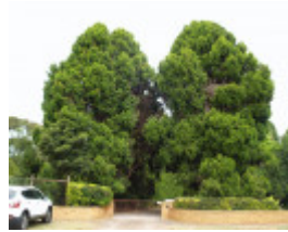
T12156 Cupressus torulosa