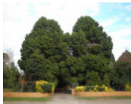
T12156 Cupressus torulosa