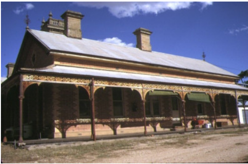
olive hills murray valley hwy browns plains rear view dec1987