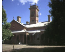
1 olive hills murray valley hwy browns plains front view dec1987