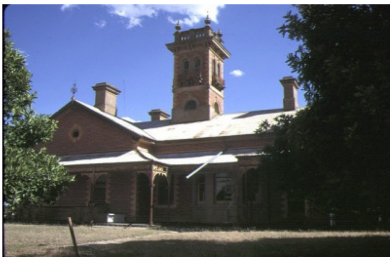
1 olive hills murray valley hwy browns plains front view dec1987