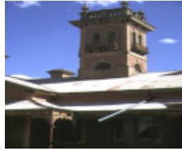
olive hills murray valley hwy browns plains detail of tower dec1987