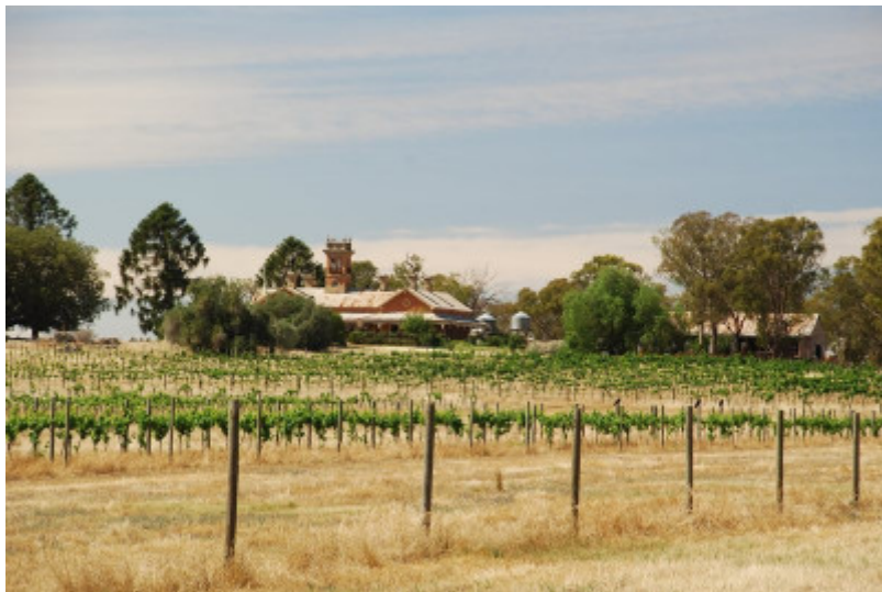
OLIVE HILLS SOHE 2008