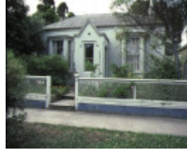
1 rosenfeld king street queenscliff front view mar1984