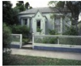
1 rosenfeld king street queenscliff front view mar1984