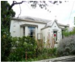
ROSENFELD SOHE 2008