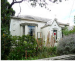
ROSENFELD SOHE 2008