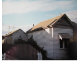
20 ALbert Street - 1986 Study