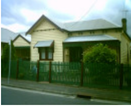
20 Albert Street, Geelong West