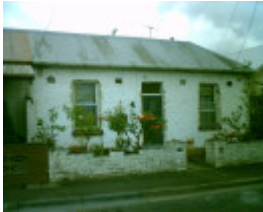
26-28 Albert Street, 1986