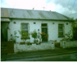
26-28 Albert Street, 1986