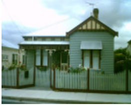
27 Albert Street, Geelong West