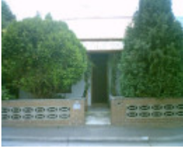
28 Albert Street, Geelong West