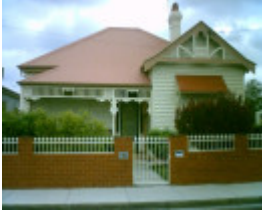
29 Albert Street, Geelong West