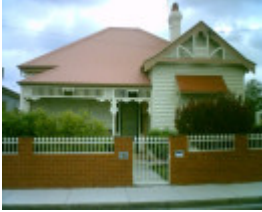
29 Albert Street, Geelong West