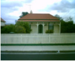
31 Albert Street, Geelong West