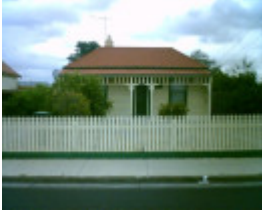
31 Albert Street, Geelong West