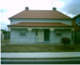
33 Albert Street, Geelong West