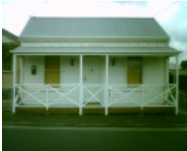
34 Albert Street, Geelong West