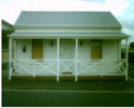
34 Albert Street, Geelong West