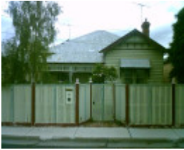
49 Albert Street, Geelong West