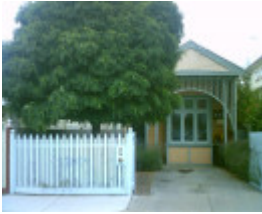
51 Albert Street, Geelong West