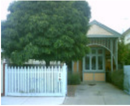
51 Albert Street, Geelong West