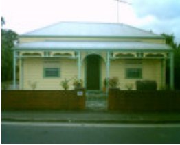
56 Albert Street, Geelong West