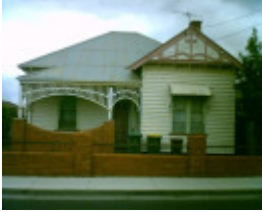
59 Albert Street, Geelong West