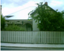
61 Albert Street, Geelong West