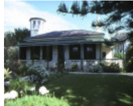
1 roseville cottage mercer street queenscliff front view