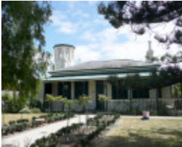
ROSEVILLE COTTAGE SOHE 2008