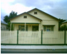
69 Albert Street, Geelong West