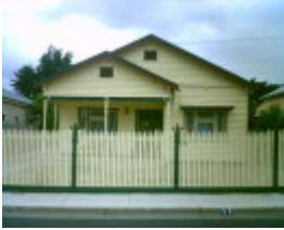
69 Albert Street, Geelong West