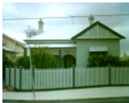
75 Albert Street, Geelong West