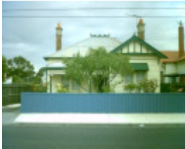
89 Albert Street, Geelong West