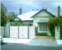
93 Albert Street, Geelong West