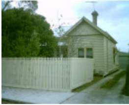
109 Albert Street, Geelong West