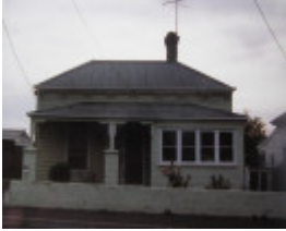
1 Arnott Street, Geelong West