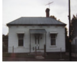
3 Arnott Stret, Geelong West