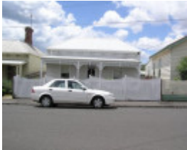
4 Arnott Street, Geelong West