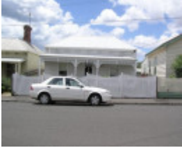
4 Arnott Street, Geelong West