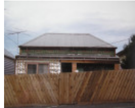
Source; Aitken, Honman & Huddle, 'City of Geelong West Urban Conservation Study', 1986