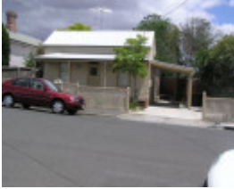
5 Arnott Street, Geelong West