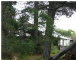
BALLARA SOHE 2008