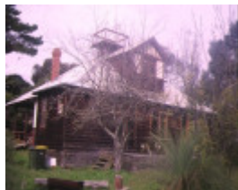
1 ballara glaneuse road point lonsdale rear elevation jun1995