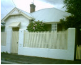
4 Avon Street, Geelong West