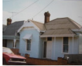
6 Avon Street, Geelong West