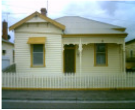
30 Avon Street, Geelong West