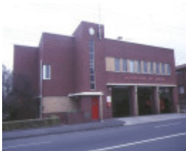
brunswick fire station & flats blyth street brunswick front elevation of fire station