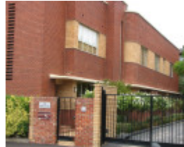
BRUNSWICK FIRE STATION AND FLATS SOHE 2008