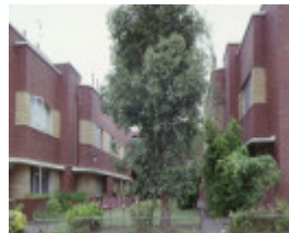
brunswick fire station & flats blyth street brunswick view of flats