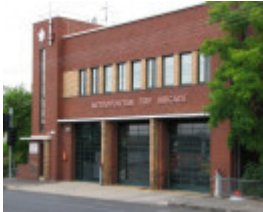
BRUNSWICK FIRE STATION AND FLATS SOHE 2008