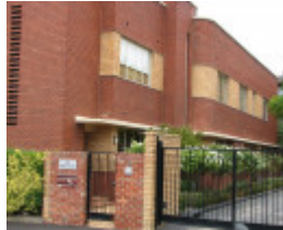
BRUNSWICK FIRE STATION AND FLATS SOHE 2008