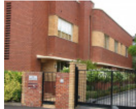
BRUNSWICK FIRE STATION AND FLATS SOHE 2008