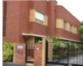
BRUNSWICK FIRE STATION AND FLATS SOHE 2008