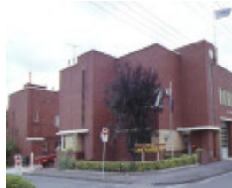
1 brunswick fire station & flats blyth street brunswick side elevation of firestation