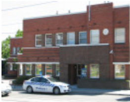
CAMBERWELL COURT HOUSE AND POLICE STATION SOHE 2008