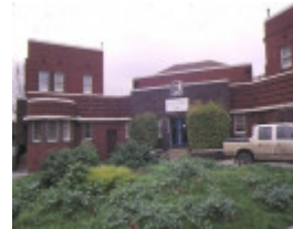
1 camberwell court house & police station front view