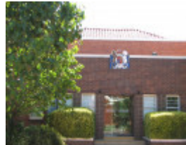
CAMBERWELL COURT HOUSE AND POLICE STATION SOHE 2008