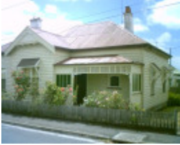
1 Bigmore Street, Geelong West