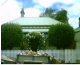
5 Bigmore Street, Geelong West