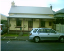
7 Candover Street, Geelong West