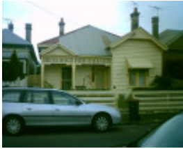
11 Candover Street, Geelong West