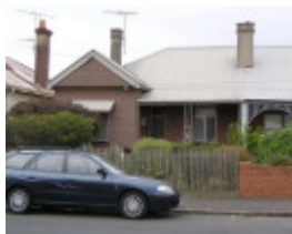
11A Candover Street, Geelong West